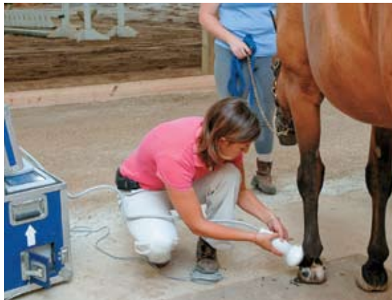
ESWT has been clinically proven to speed healing and improve quality of healing.

ESWT equipment varies depending on whether it generates focused or unfocused shock waves. Focused shock waves target a specific treatment area to deliver focused energy with deep tissue penetration—this is the preferred format to treat musculoskeletal problems. A typical treatment protocol utilizes one to three treatments